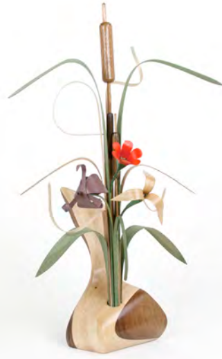
Loon: 03-3-F Maple vase with black walnut accents. HT: 24 in