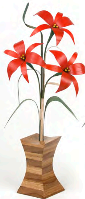
113-43-LY-O 3 ORANGE LILIES HT: 24"