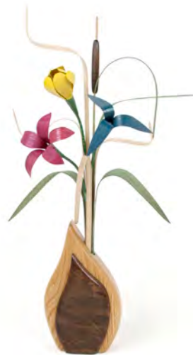
Seedlings III: 140-F Red oak vase accented with black walnut. HT: 20 in