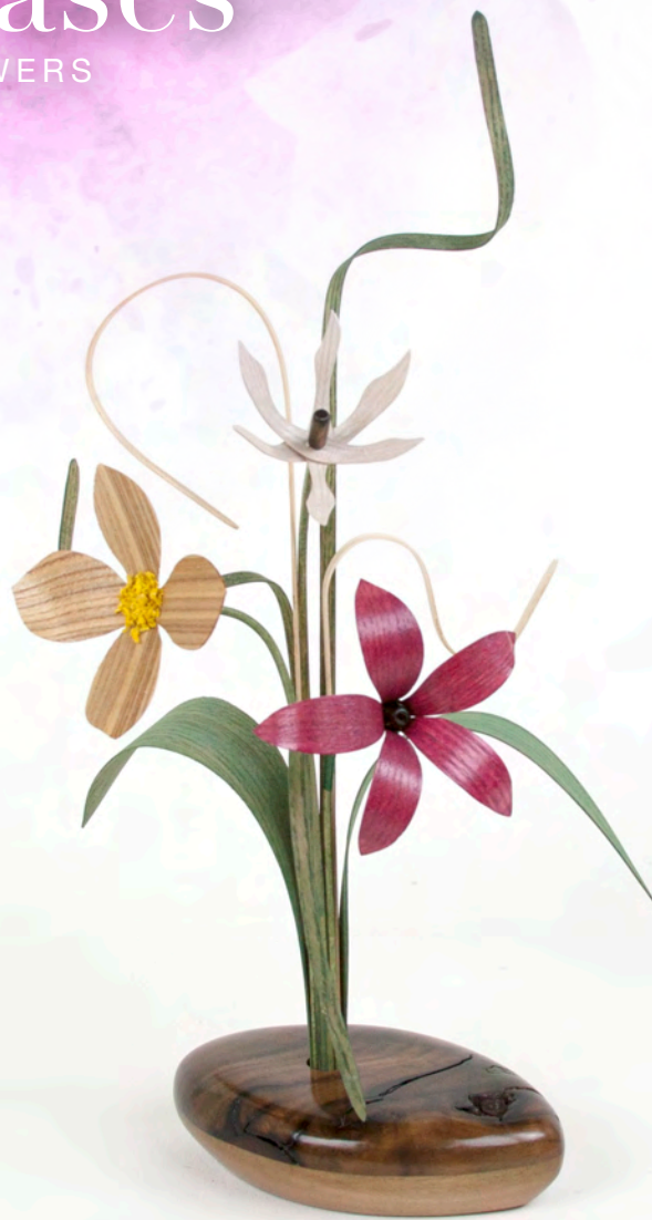
Nature's Gift: 113-01-F The visual interest and personality created from a black walnut tree's ability to heal from an injury is celebrated in this vase design. HT: 14 in