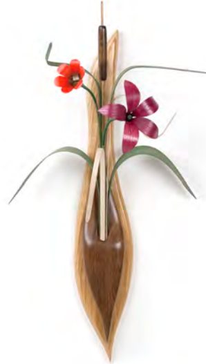
Birds in Flight II: 261-F Wall vase available with red oak back and a black walnut front (pictured left) or a black walnut back with a red oak front (pictured right). HT: 20 in