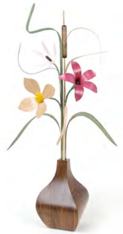
Classic Balance (Small): 120-F Vase available in red oak or black walnut (pictured). HT: 20 in