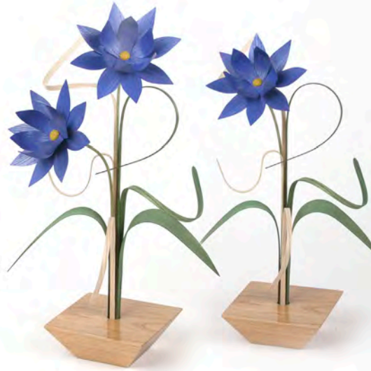
112-32-LF-P 2 PURPLE LOTUS FLOWERS HT: 20"