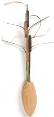
Roots of Simplicity I: 200S-C Red oak vase. HT: 20 in