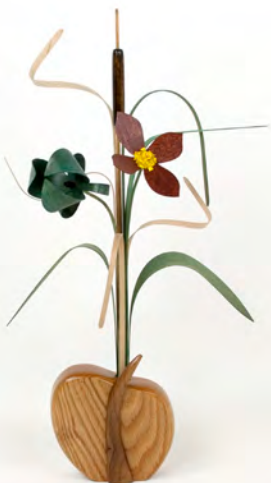
Seedlings I: 135-F Red oak vase accented with black walnut. HT: 18 in