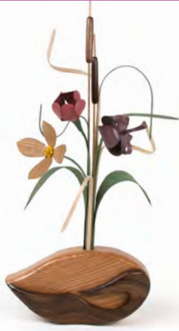
At Rest: 162-F Red oak vase accented with black walnut. HT: 20 in