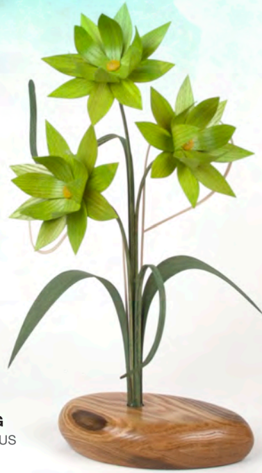
114-03-LF-G 3 GREEN LOTUS FLOWERS HT: 20"