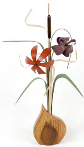
Seedlings II: 136-F Red oak vase accented with black walnut. HT: 18 in