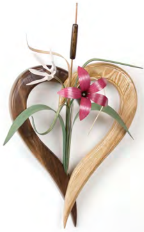
Heart: 3001-F Wall vase is black walnut back with red oak on the front. HT: 18 in