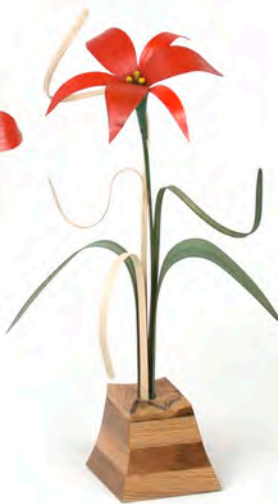
113-41-LY-O 1 ORANGE LILY HT: 18"