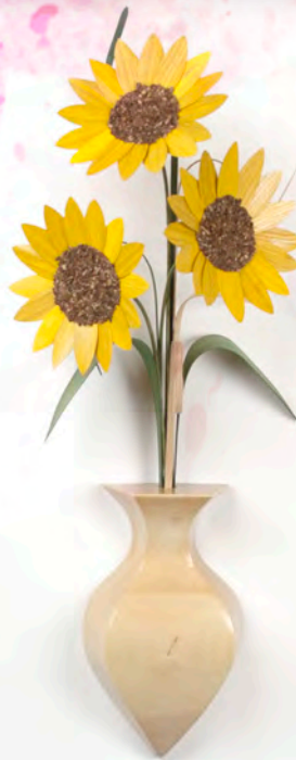
211-25-SF 3 SUNFLOWERS HT: 26"