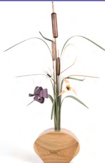
Contemporary Balance III: 109-50-F Vase available in red oak (pictured) or black walnut. HT: 28 in