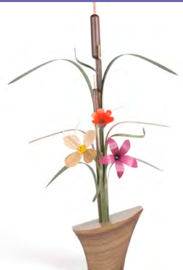
Contemporary Balance IV: 109-51-F Vase available in black walnut (pictured) or red oak. HT: 28 in