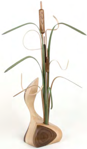
Loon: 03-3-C Maple vase with black walnut accents. HT: 24 in