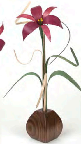
109-20-LY-M 1 MAUVE LILY HT: 18 in