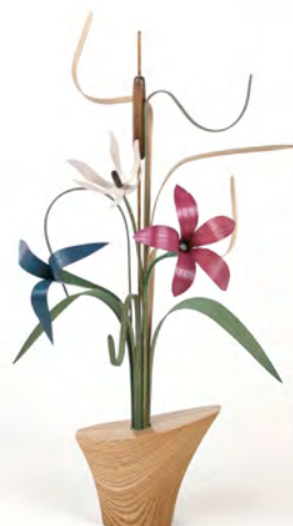
Contemporary Balance II: 109-11-F Vase available in red oak (pictured) or black walnut. HT: 18 in