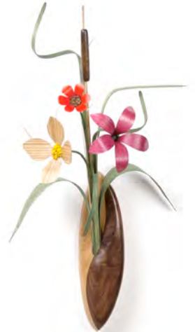
Feathers: W315-F Wall vase is red oak back with black walnut front accent. HT: 18 in