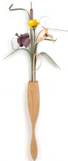
Roots of Simplicity III: 200F-F Red oak vase. HT: 28 in

To keep up with our latest flower and vase designs, visit woodwildflowers.com/catalog