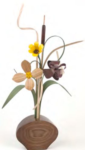
Contemporary Balance I: 109-10-F Vase available in red oak or black walnut (pictured). HT: 18 in