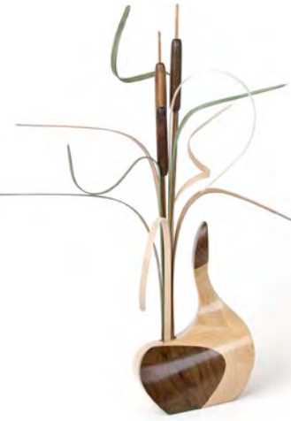
Mudhen: 03-1-C Maple vase with a black walnut accent. HT: 18 in