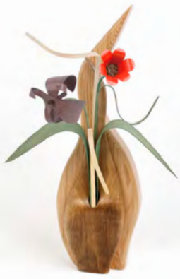
Shorebirds: 161-F Red oak vase accented with black walnut. HT: 16 in