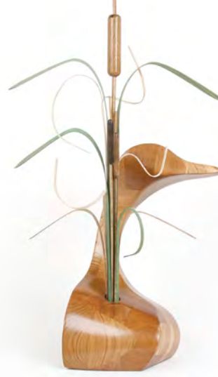
Trumpeter: 04-1-C Cherry vase. HT: 26 in