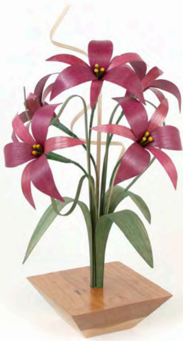
112-35-LY-M 5 MAUVE LILIES HT: 22"