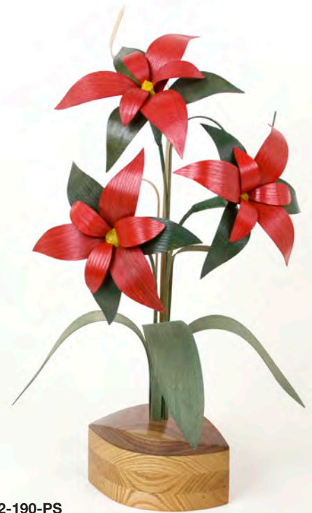
112-190-PS 3 POINSETTIAS HT: 20"