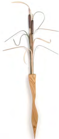
Roots of Simplicity II: 200F-C Red oak vase. HT: 28 in