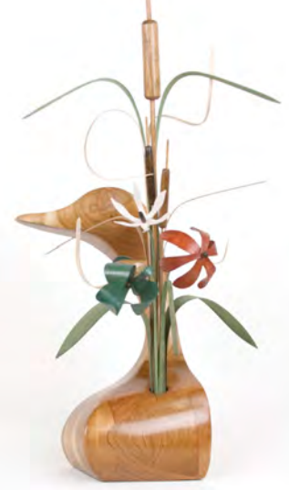
Trumpeter: 04-1-F Cherry vase. HT: 26 in