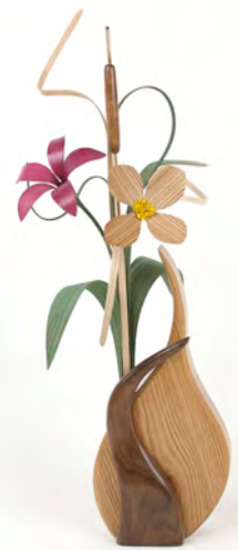
Seedlings IV: 160-F Red oak vase accented with black walnut. HT: 20 in