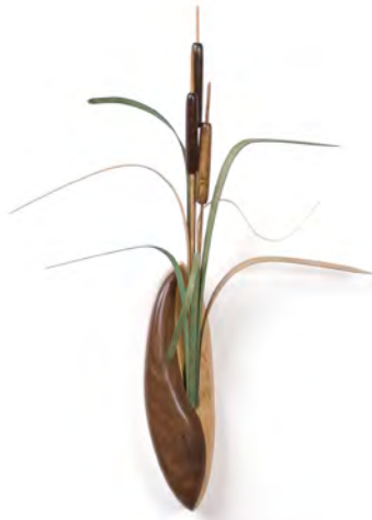
Feathers: W310-C Wall vase is red oak back with black walnut front accent. HT: 18 in