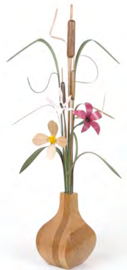
Classic Balance (Large): 170-F Vase available in red oak (pictured) or black walnut. HT: 30 in