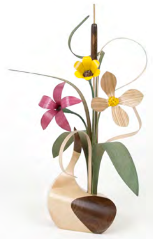
Mudhen: 03-1-F Maple vase with a black walnut accent. HT: 18 in