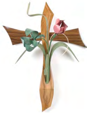
Cross: 4001-F Wall vase is black walnut back with red oak on the front. HT: 16 in