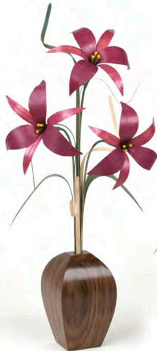
109-21-LY-M 3 MAUVE LILIES HT: 22 in