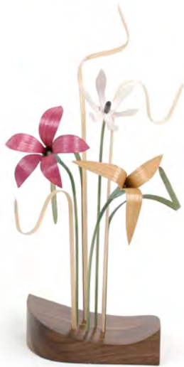
Graceful Leaf: 111-75-F Vase is black walnut. HT: 14 in